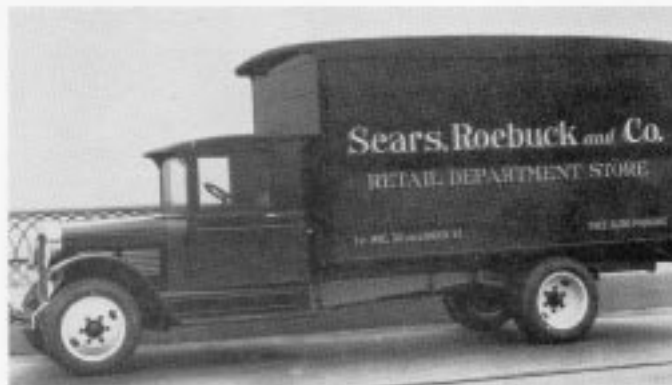
1928 SEARS ROEBUCK AND COMPANY VAN