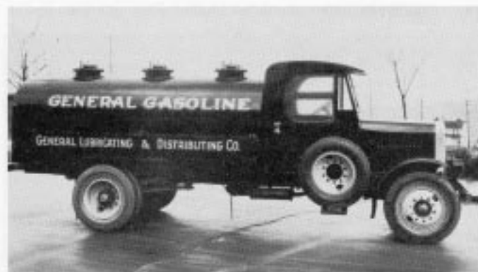
1927 GENERAL GASOLINE TANKER