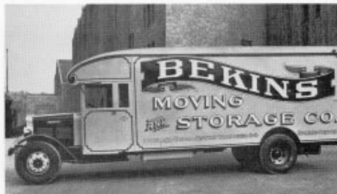
1929 BEKINS MOVING AND STORAGE VAN