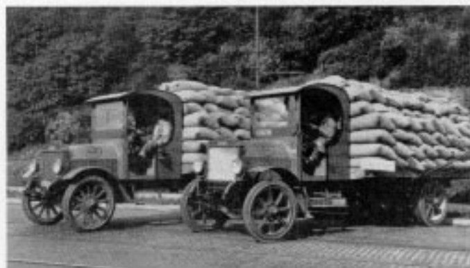
1924 A-1 FEED COMPANY FLAT BEDS

Kenworth Trucks have traversed the nations highways since 1923 (actually since 1915 under the predecessor name Gersix) and have undergone many appearance changes during that period of time. This pictorial review attempts to display some key changes in configuration that have occurred over the years and to chronicle several of the many varied applications in which Kenworth products have met the test.