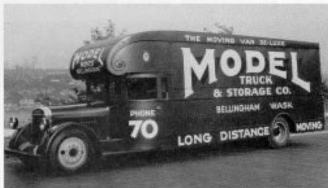
1928 MODEL TRUCK AND STORAGE VAN